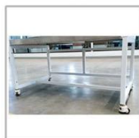
Base Stand Optional